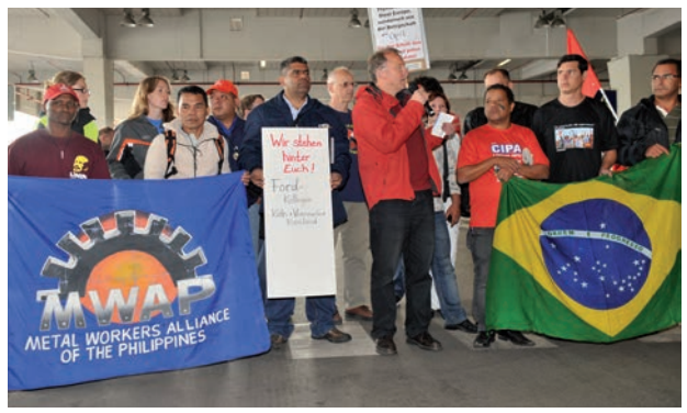
International solidarity between automotive workers