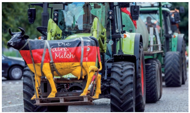
United across Europe, dairy farmers fight against their ruin.