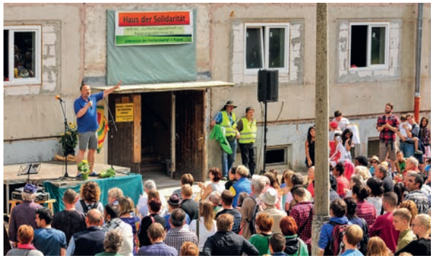
Topping-out ceremony for the "House of Solidarity" in Truckenthal, Thuringia, 2016