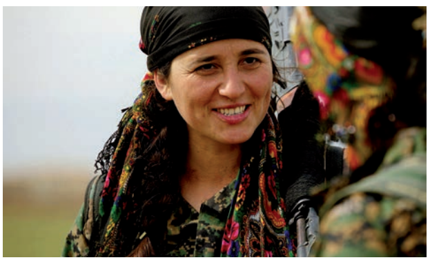
Kurdish women members of the YPJ (Women's Defense Units) in Rojava, North Syria