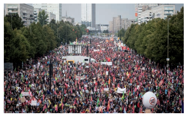
Mass demonstration against the planned free trade agreement TTIP, Berlin, 2016