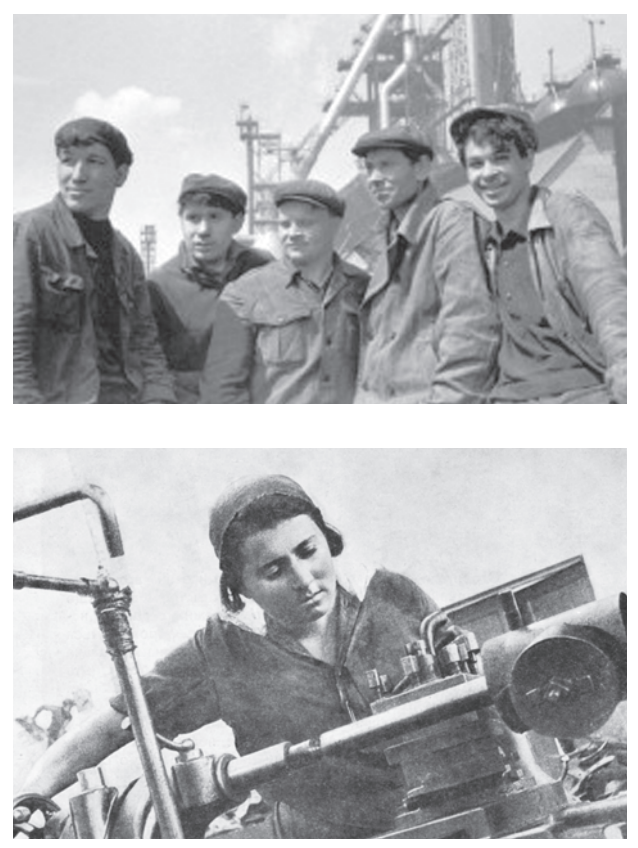
Socialist construction in the Soviet Union in the 1920s