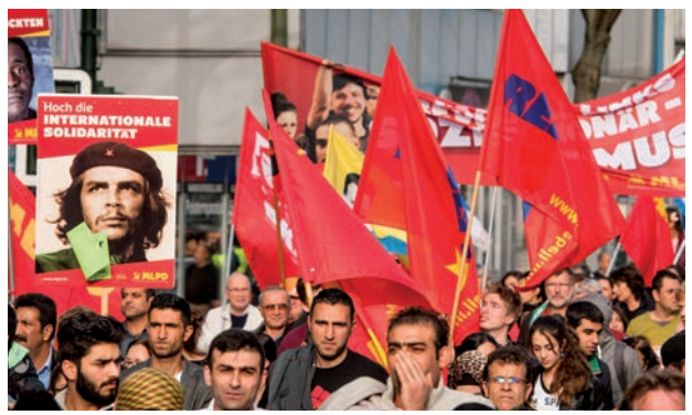
Support for refugees in the joint struggle