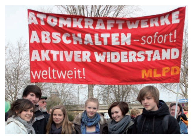
Protest for the shutdown of all nuclear power plants, 2011