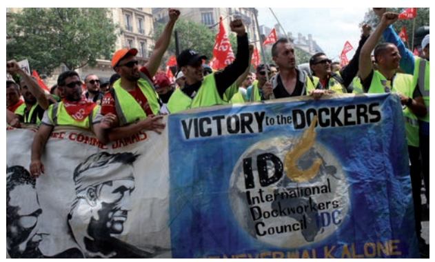
Europe's dockworkers score success against EU "Port Package" directive. Here: dockers in Paris in 2016