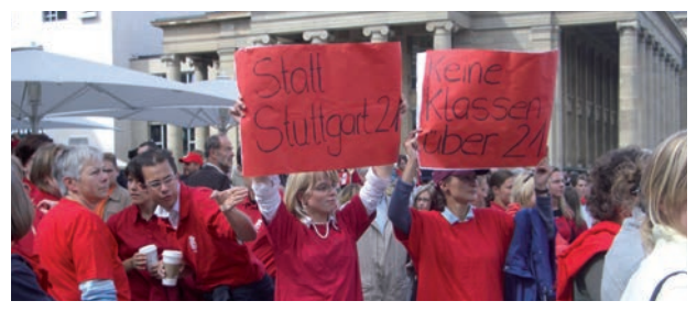
Protest by women teachers