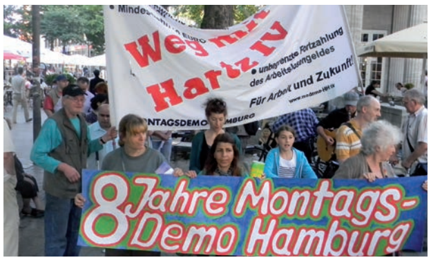
2004 marked the beginning of the Monday demonstrations against the Hartz laws, which continue to take place in many German cities.