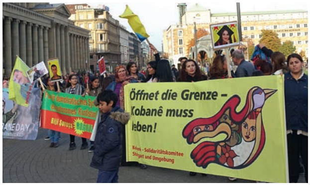
Solidarity with the Kurdish liberation struggle in Rojava, North Syria