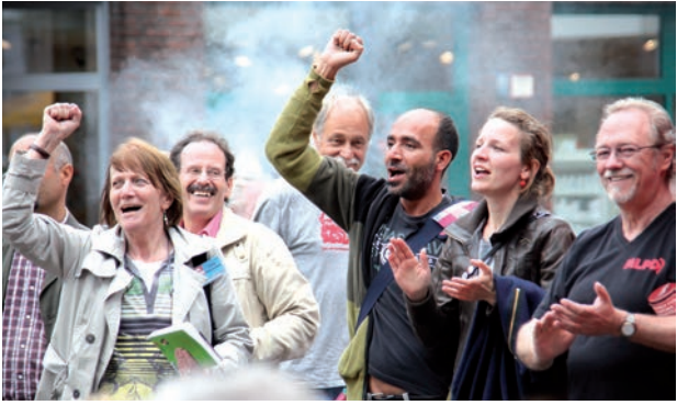
Rally during the 2013 federal election campaign