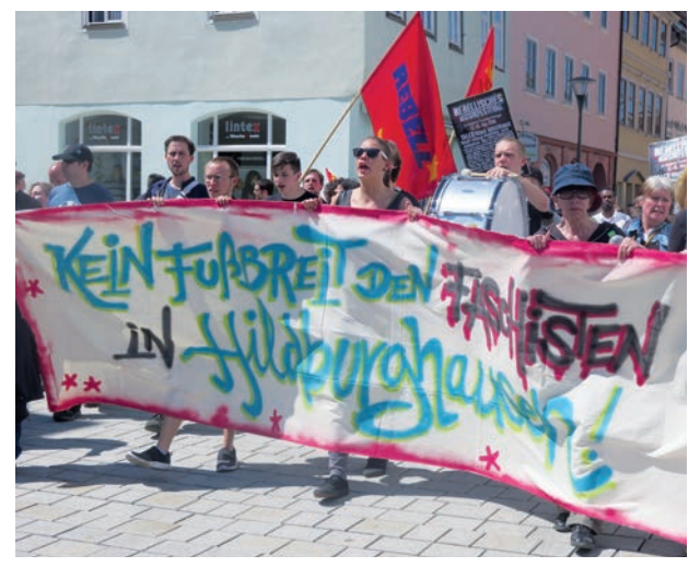
Anti-fascist demonstration in Hildburghausen in 2016, initiated by the Youth League Rebell

The monopolies and parts of the state apparatus and the mass media support the neo-fascists as shock troops and reserve against revolutionary movements and workers'