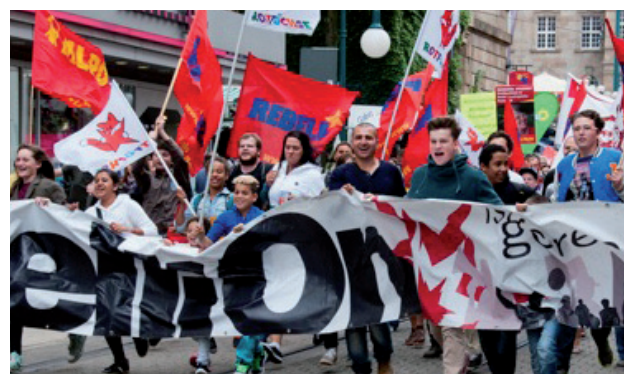
The Youth League Rebell in action