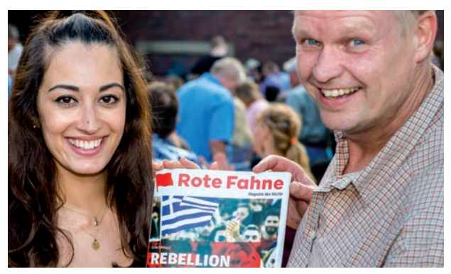
Rote Fahne, the central organ of the MLPD, has been appearing for over 45 years.

way. It is a result of bourgeois manipulation of opinion that today the broad masses, for the most part, have in their minds a distorted image of scientific socialism.