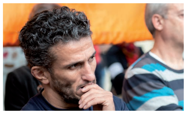
Courses for learning the dialectical method serve to enable the members and the masses to find their bearings independently.