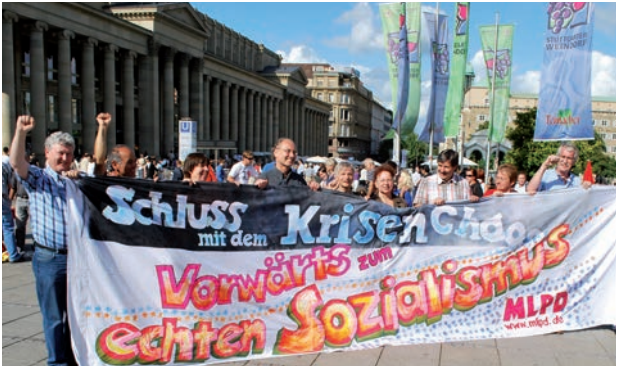
MLPD rally in Stuttgart in 2009