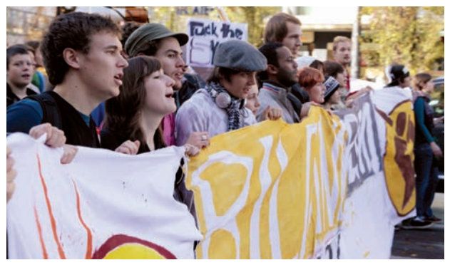
Student protests against tuition fees