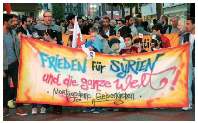
"Peace for Syria" demonstration in Gelsenkirchen