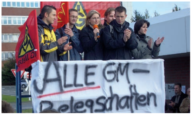
The self-organized strike of the Bochum Opel workforce in 2004 received broad support.