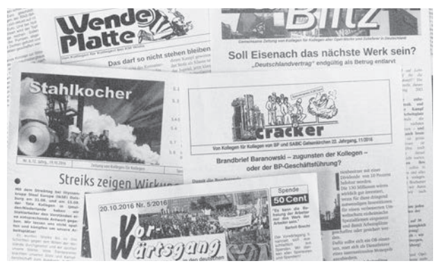
The members of the MLPD cooperate in producing many factory and corporation-wide newssheets "by workers, for workers".

The Marxist-Leninists irreconcilably oppose any attempt by the reformist union bureaucracy to boss around the millions of union members and to impede the development of class struggle. On the other hand, they reject any kind of activity hostile to the union and, on the basis of constructive trade union work, help the workers to successfully cope with an oppositional mode of thinking.