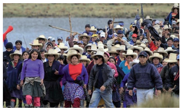
Protest in Peru against environmental devastation caused by the Newmont Mining gold mine