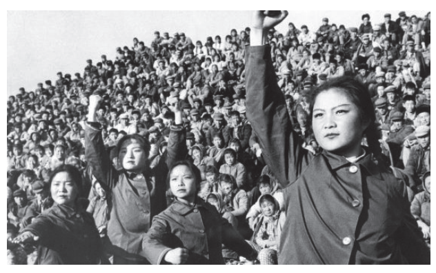
Cultural presentation at a mass meeting during the Great Proletarian Cultural Revolution