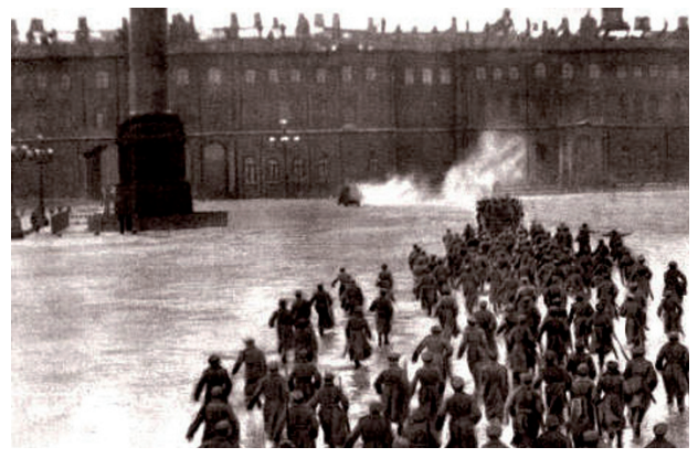
October Revolution of 1917 in Russia: storming the Winter Palace