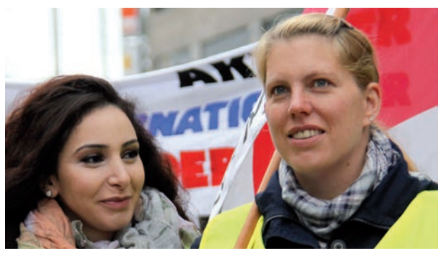
Functions of the state are transferred to the masses.