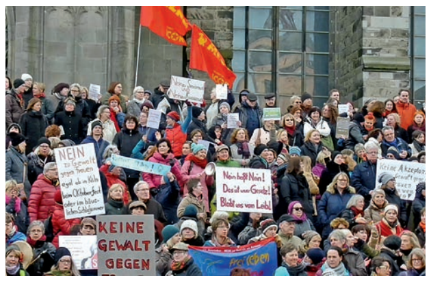
Protesting violence against women and racism in Cologne, 2016