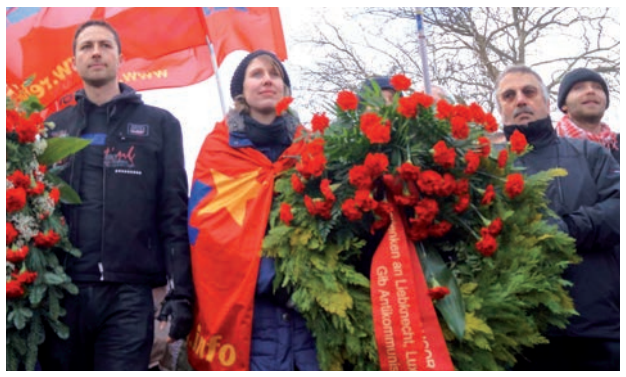
Annual commemoration of the revolutionaries Lenin, Liebknecht and Luxemburg in Berlin – the biggest manifestation for socialism in Europe