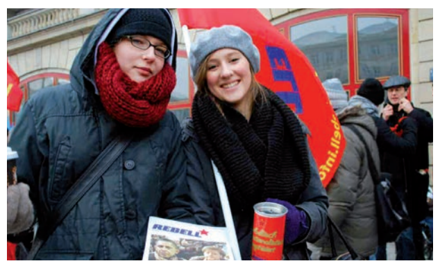
MLPD and Rebell finance their work through membership dues and donations.