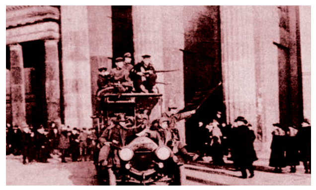
November Revolution of 1918 in Germany: worker-militiamen at Brandenburg Gate