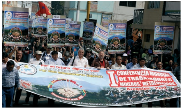
Meeting of workers and demonstration at the First International Miners' Conference in Arequipa, Peru, 2013