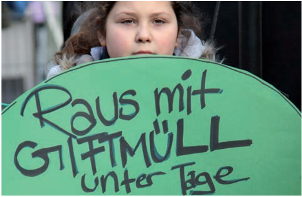
Protest against storage of toxic waste in mines