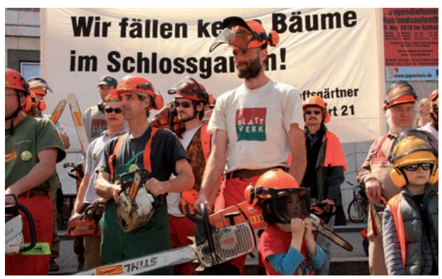
Landscape gardeners against Stuttgart 21 rail project