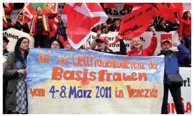
Women's power: World Women's Conferences of grassroots women successfully held in Venezuela (2011) and Nepal (2016)