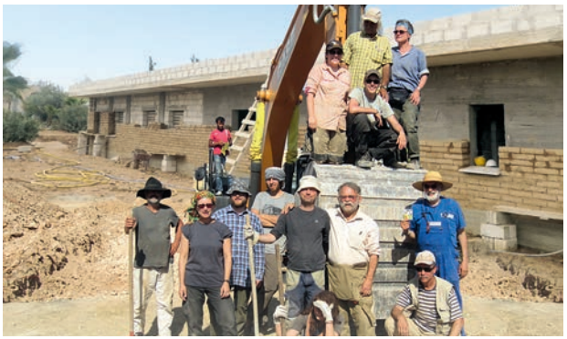
ICOR Solidarity Pact: construction of a health center by international brigades in Kobanê, North Syria, 2015

The MLPD develops manifold bilateral relations for mutual support in party building and collaboration with other revolutionary forces on an equal basis. The MLPD promotes solidarity pacts and international solidarity brigades for mutual support of the revolutionary struggle for liberation all over the world. The new quality of