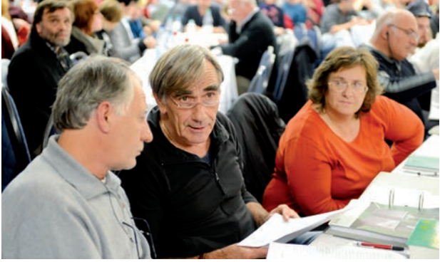
Europe Seminar of MLPD and ICOR in 2012